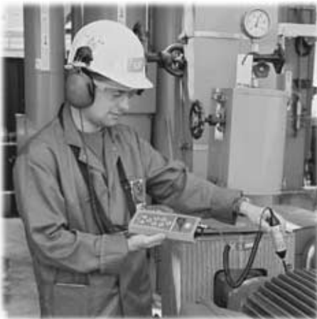
Ultrawave 170MD: The Smartest Ultrasonic Detector in the World