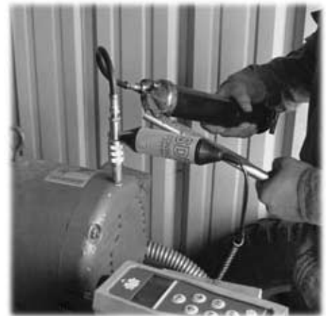
Acoustic Grease Gun Adaptor Do it Right the First Time

Call Today and Receive Our Ultrasonic Lube Training CD-ROM FREE!