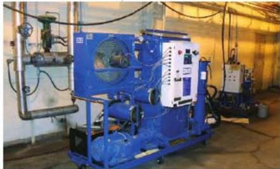
Vacuum Dehydrator installation

One of the key characteristics of a Morgoil® type fluid is that it has excellent demulsibility and can function very effectively in the presence of gross free water. Manufacturers of steel mill equipment (ie Danieli, Morgoil®) commonly specify fluid brands and trade names that are qualified and recommended for use in these applications. Steel mills encounter very high amounts of water and particulate in these lube applications. The mill might have a single tank for oil