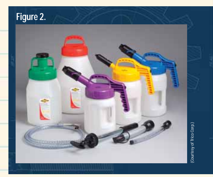
Examples of sealable, cleanable lubricant handling containers designed for in-plant use.