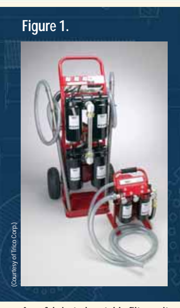
A prefabricated portable filter unit designed for pre-filtering lubricants.

Filtering lubricants prior to use can be done easily and relatively inexpensively. Filter elements should have high dirt-holding characteristics, low